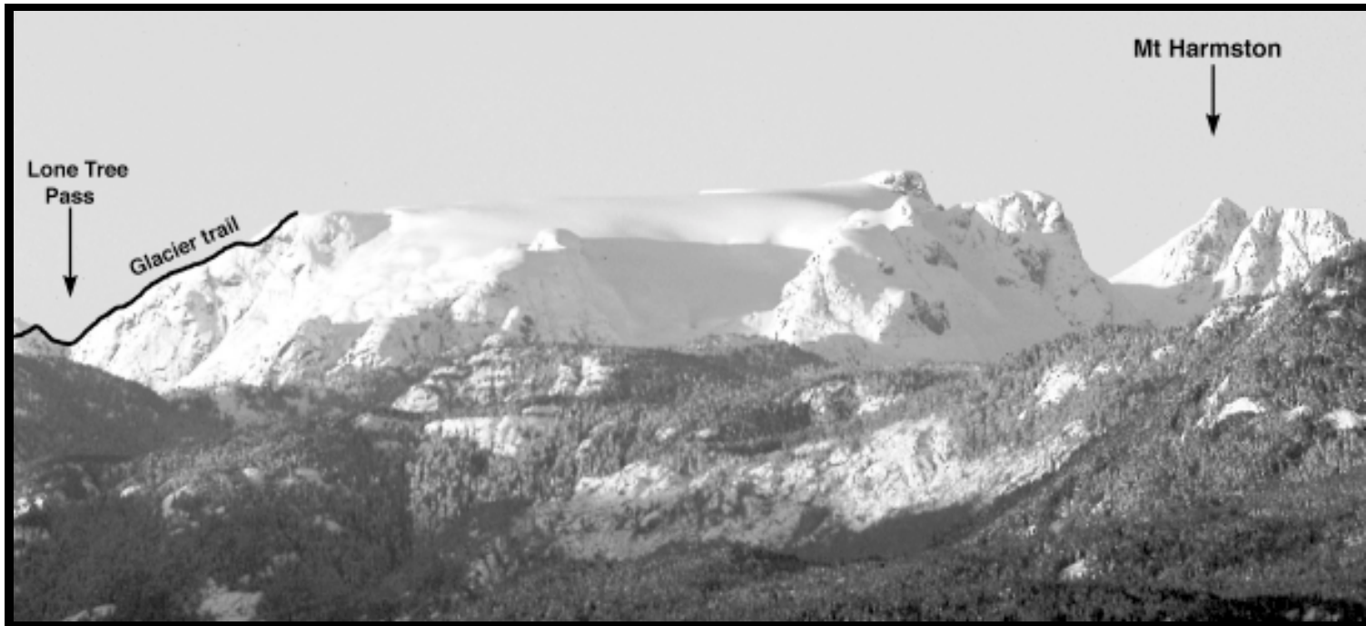
COMOX GLACIER, NORTH EAST ASPECT, FROM RYAN RD. COURTENAY