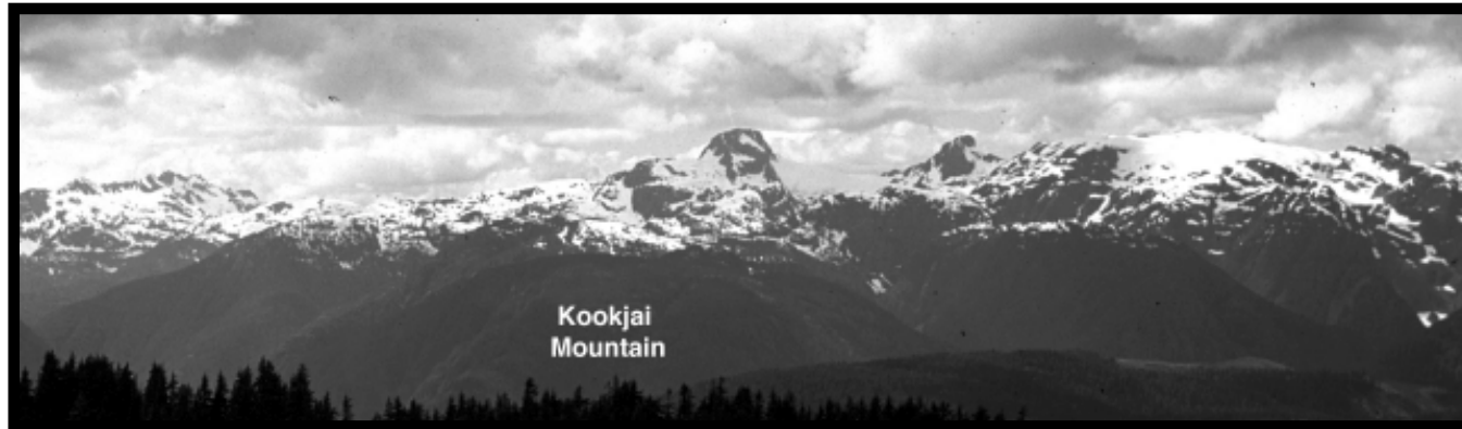
COMOX GLACIER AND CLIFFE GLACIER PEAKS, WEST ASPECT, FR MT CLIFTON, BEAUFORT RANGE