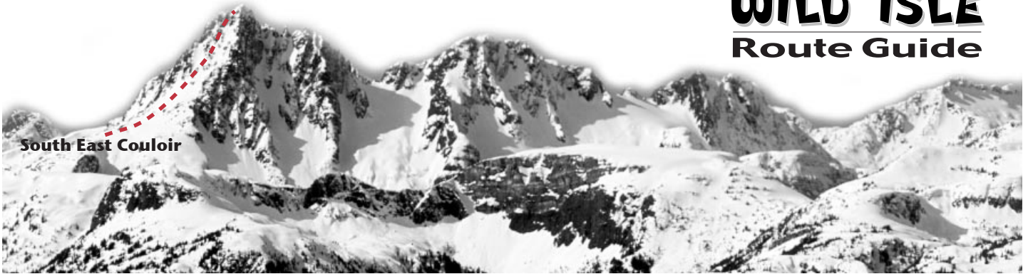
Photos: Above-Golden Hinde east aspect from Mt Washington, February, Below- Golden Hinde north aspect from The Comb, October, Bottom Right- Golden Hinde north west aspect from North Glacier, October.